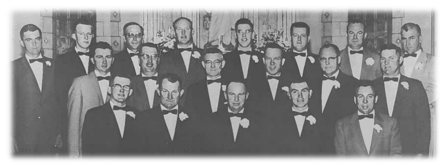
If you recognize anyone in this picture. Please contact the church office so we can include the information in next month's newsletter. This picture was found in the Diamond Jubilee of St. John's Lutheran Church .